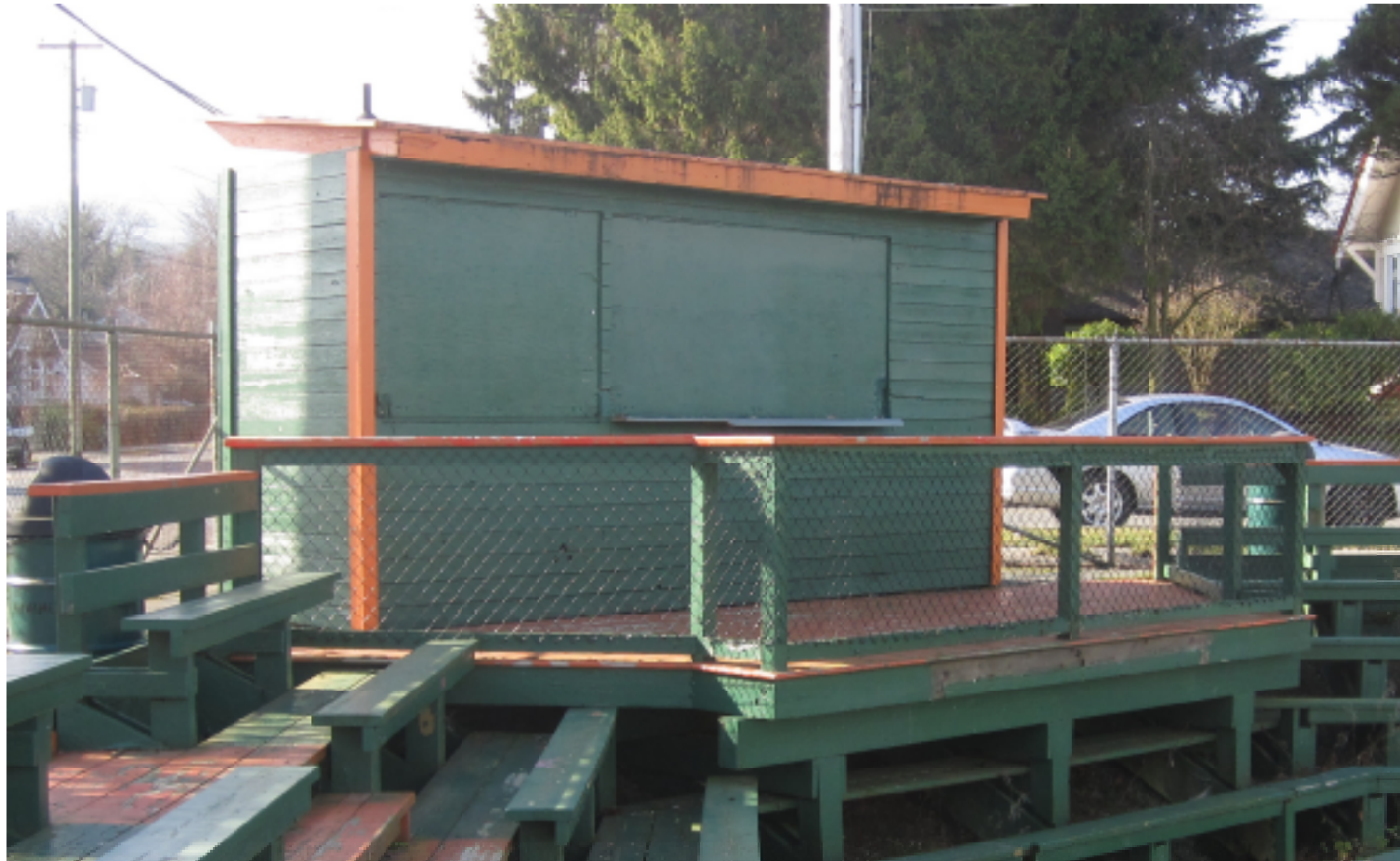
EXISTING CONTROL BUILDING